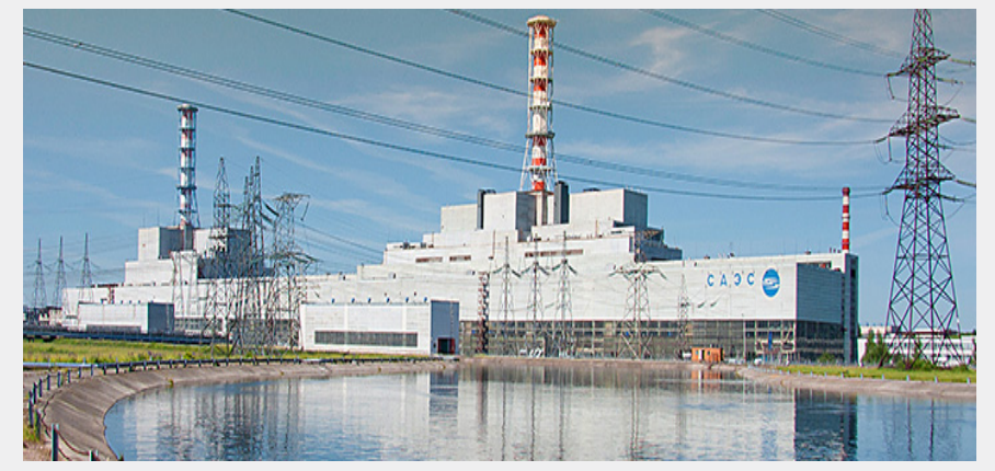
Smolensk Nuclear Power Plant